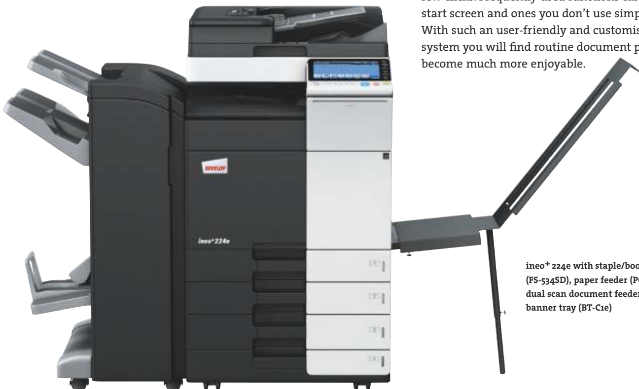
ineo+ 224e with staple/booklet finisher (FS-534SD), paper feeder (PC-210), dual scan document feeder (DF-701), banner tray (BT-C1e)

Many multifunctional office systems are anything but user-friendly. The ineo+ 224e, in contrast, is simplicity itself. An intuitive, easily understandable operating concept ensures that it is as easy to use as your smartphone or tablet. The 9-inch capacitive touchscreen comes with familiar multi-touch operations such as flick, drag&drop and pinch in&out – so you will feel at home in this system in no time at all. Thanks to a new menu navigation structure you can see all functions in one go and select the settings you want with just a few clicks. Frequently used functions can be left on the start screen and ones you don't use simply removed. With such a user-friendly and customisable office system you will find routine document production jobs become much more enjoyable.