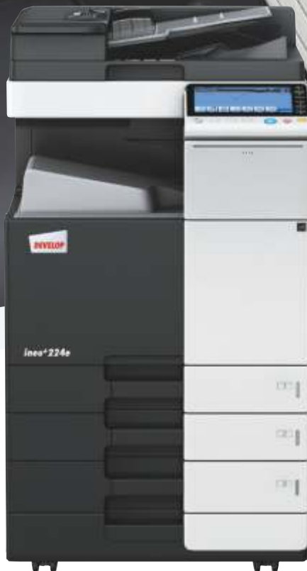
ineo+ 224e with paper feeder (PC-210) and dual scan document feeder (DF-701)